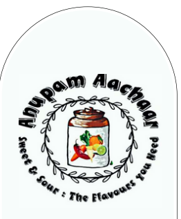
Anupam Pickles Founder - Ankush