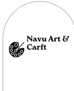
Navu Art & Craft Founder-Navneet