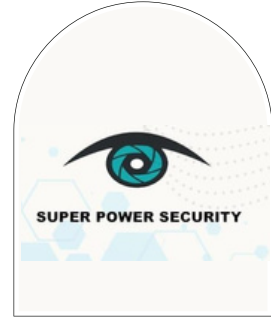
Super power Securities Founder-Sumit