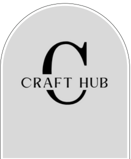
Craft Hub Founder - Dimpal