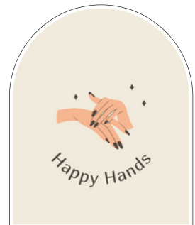
Happy Hands Founder-Dimpal