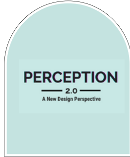
Perception 2.0 Founder - Vandhana